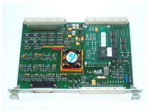
Fig. 3 – SPC board